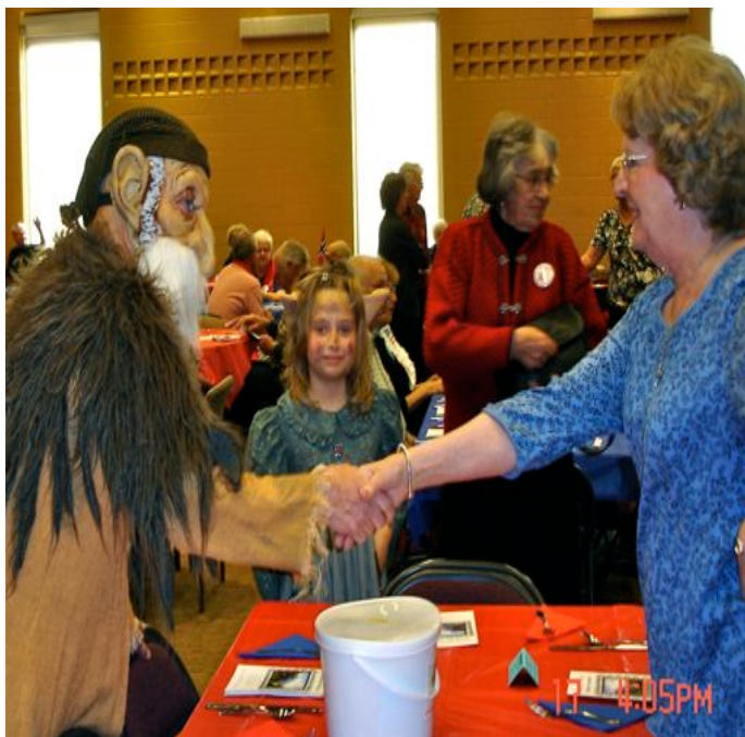
Is This Troll is Running for Office?