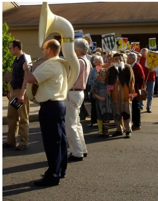
Playing for the Parade